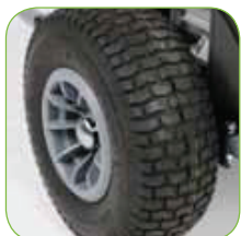
Two large diameter treaded wheels, ideal for moving the machine on all types of surface.