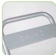
Easy handling on every kind of surface thanks to excellent weight distribution and ergonomic handle.