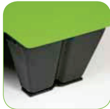
Sturdy painted steel frame.