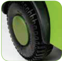
Large diameter wheels to facilitate movement.