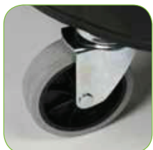
Trolley with large-diameter swivelling wheels with tyres for easy manoeuvring.