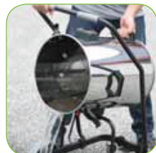
Reinforced steel tank with handles to facilitate emptying.