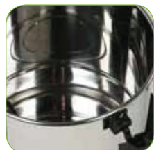
Robust steel tank.